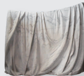
時間 / 空間 | Time / Space

大理石 | Marble 400 x 150 x 130 cm (L x W x H)