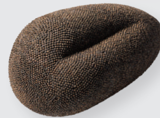
種子-心 | Seed-Heart

木頭、松果鱗片 | Wood, Pine cone scales 46 x 98 x 48 cm (L x W x H)